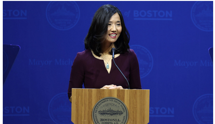
Mayor Michelle Wu speaks at the State of the City 2024 event.