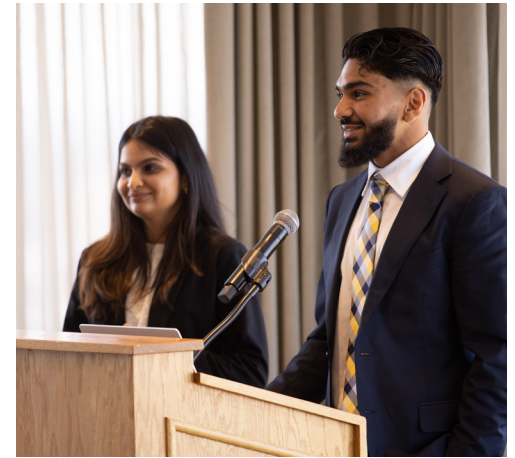
College of Management students speak at a BEST Boston event.