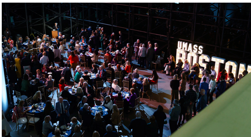
UMass Boston hosted more than 400 alumni at their annual holiday reception.