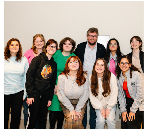
John Green, bestselling author of Paper Towns and The Fault in Our Stars, poses for a photo with students from The Mass Media and Student Arts and Events Council during a Welcome Week event.