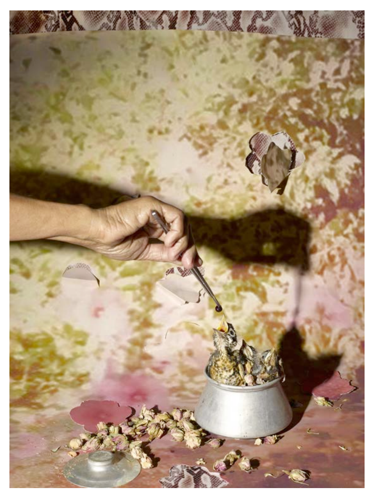
Sheida Soleimani, Safekeeping, pigment print, 2022.