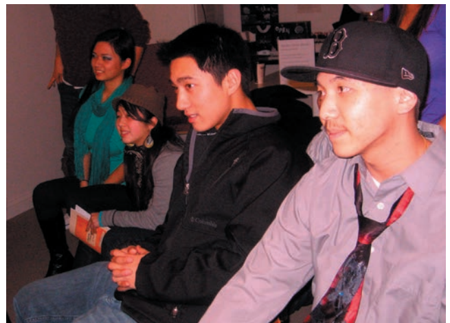
Student performers and friends supporting each other

What I'd give to travel your shores and not come back Only call me of your own free will — I'll run back I remember the scent of salt from your lips Taste the light basking on your warm-as-sun back I'll shoulder the blame, I stepped away from your vineyards But ever since I'm dreaming of your welcome back Like fruit left to rot uncollected past harvest They melt down to soil and on instinct turn back Are you waiting like lonely rock beaches? Don't smile Until winter when sand from the deep washes on back The dancers have drifted out of the hotel corridors No singer today can sing my song back Even the Castro stood empty this past Halloween what revelry now will tempt the throng back? Tell the server at Peets “Molly with two l's and a y” I'll fly through the fog and expect coffee with my welcome back