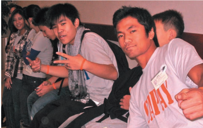
CAPAY youth organizers

The day before Halloween, over 100 high school students and educators packed the Campus Center for the Symposium, a one-day Asian American leadership conference. CAPAY has hosted the Symposium since 1993 to provide a forum for learning about Asian American communities, history, and current issues. The event is planned almost entirely by high school students.