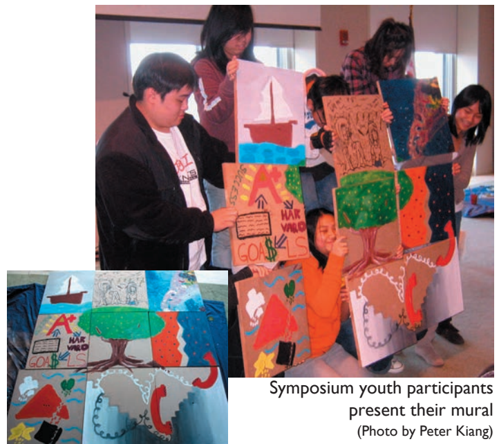
Symposium youth participants present their mural