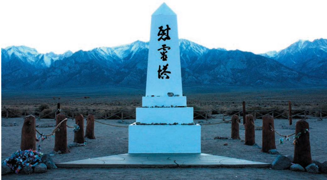
Manzanar Cemetery Monument