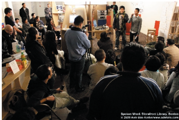
Students performing at the Chinatown Storefront Library Open Mic